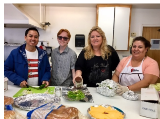
Volunteers and funding from Big Sunday, allowed us to hold a Memorial Day celebration for our kids at Hope House.